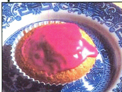
The Women's Institute is banned from making cakes for patients

The Women's Institute in Saffron Walden has been banned from making cakes for hospital patients due to health fears.